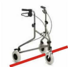
Diagram 2 a